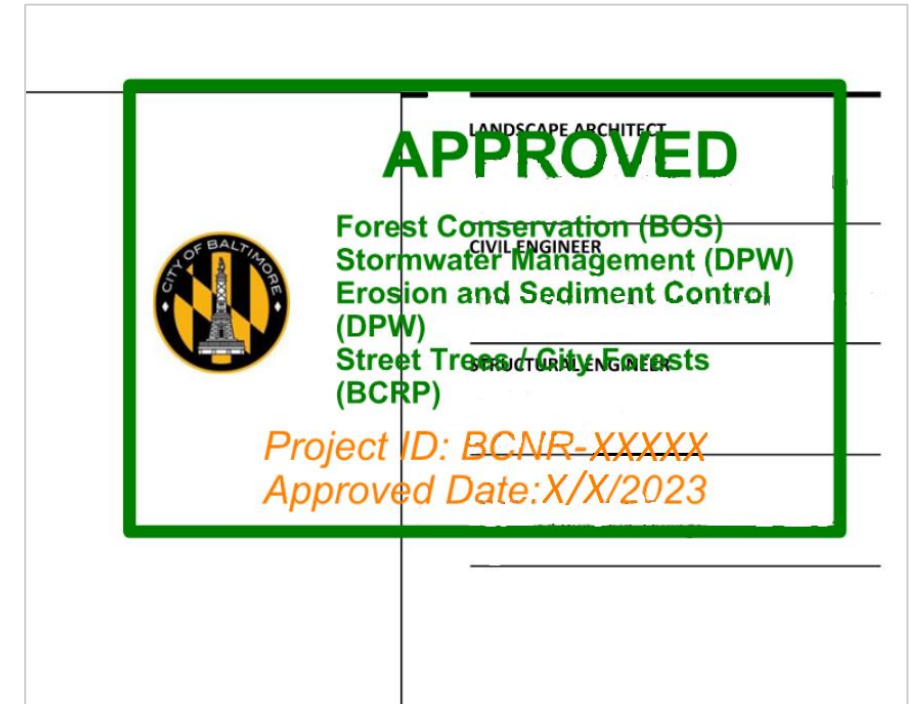
“Green stamp” for approved BCNR plan set.

In 2022, Baltimore City's Department of Public Works (DPW) introduced a new review portal to coordinate environmental reviews across City agencies. Reviews for Erosion and Sediment Control/Stormwater Management, forest conservation, floodplain impacts, Critical Area impacts, and street and park tree impacts all now occur within this new portal, also known as BCNR (Baltimore City Natural Resources). You can create a BCNR account here . A project typically undergoes three stages of review in BCNR – Concept, Site Development, and Final. After Final plans have been submitted, reviewed, and approved by all applicable environmental review agencies, DPW uploads “green stamp” approved plans to BCNR, which can then be used to receive final permit approval in ePlans , Baltimore City DHCD's permit system.